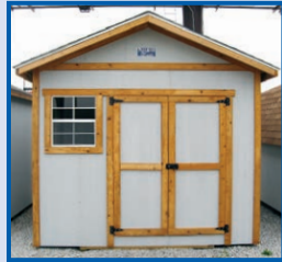
Regular Gable Incl. Loft, 8' Walls