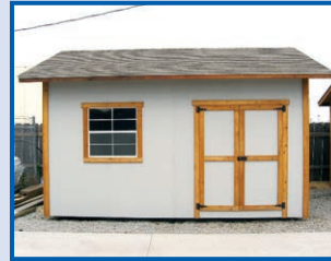
Tall Gable Incl. 2 Lofts, 2 Over-head Shelves, 9' Walls