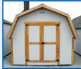
Short Wall Barn Incl. Loft, 4.5' Walls