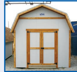
Tall Barn Incl. 2 Lofts, 2 Over-head Shelves, 7' Walls